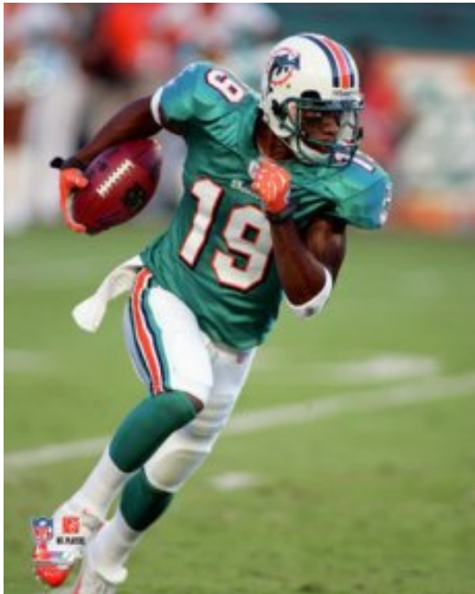
Regarding Tedd Ginn Jr.

I don't really get this trade from Miami's standpoint. Sure, he was a bust as a Top 10 WR, but