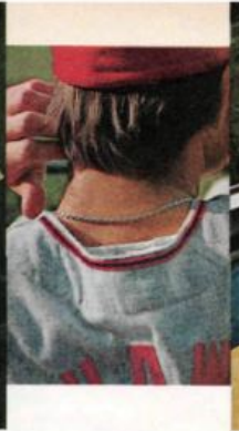
off at the stadium—and finally seizes (below) to face a new life an