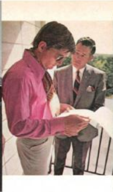
symbol for peace); he brought along his business deals with associates, and his image as a blithe, if shaggy, spirit to spread all around.