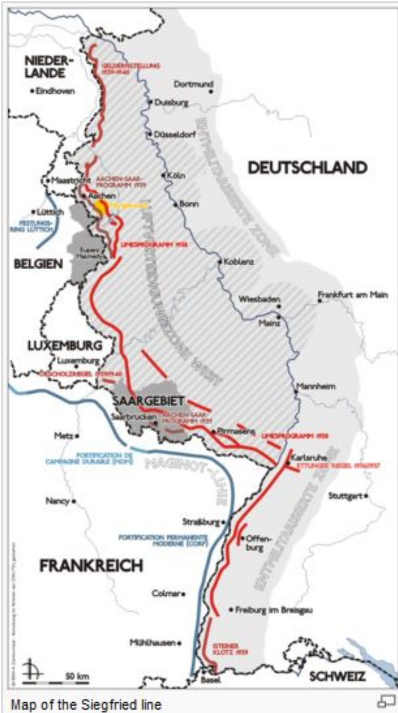
Map of the Siegfried line

Thursday, July 04 2013 11:00 AM - Last Updated Wednesday, July 03 2013 5:36 PM