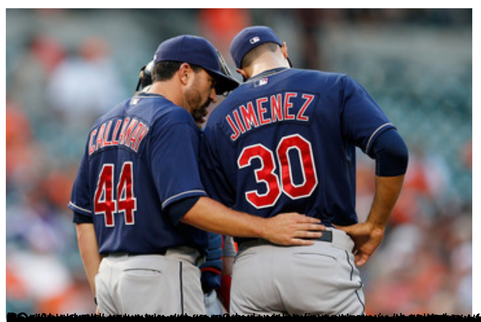
An ad shearstally shath har strangested after One ring Day of 2012