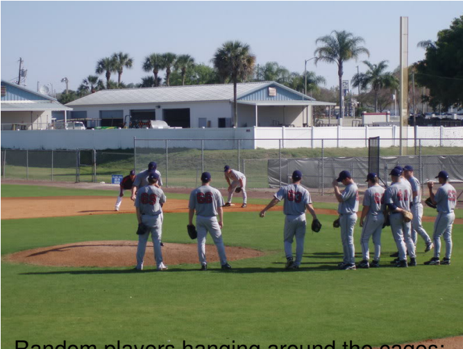
Random players hanging around the cages:

Written by {ga=consigliere} Sunday, March 11 2007 7:00 PM -