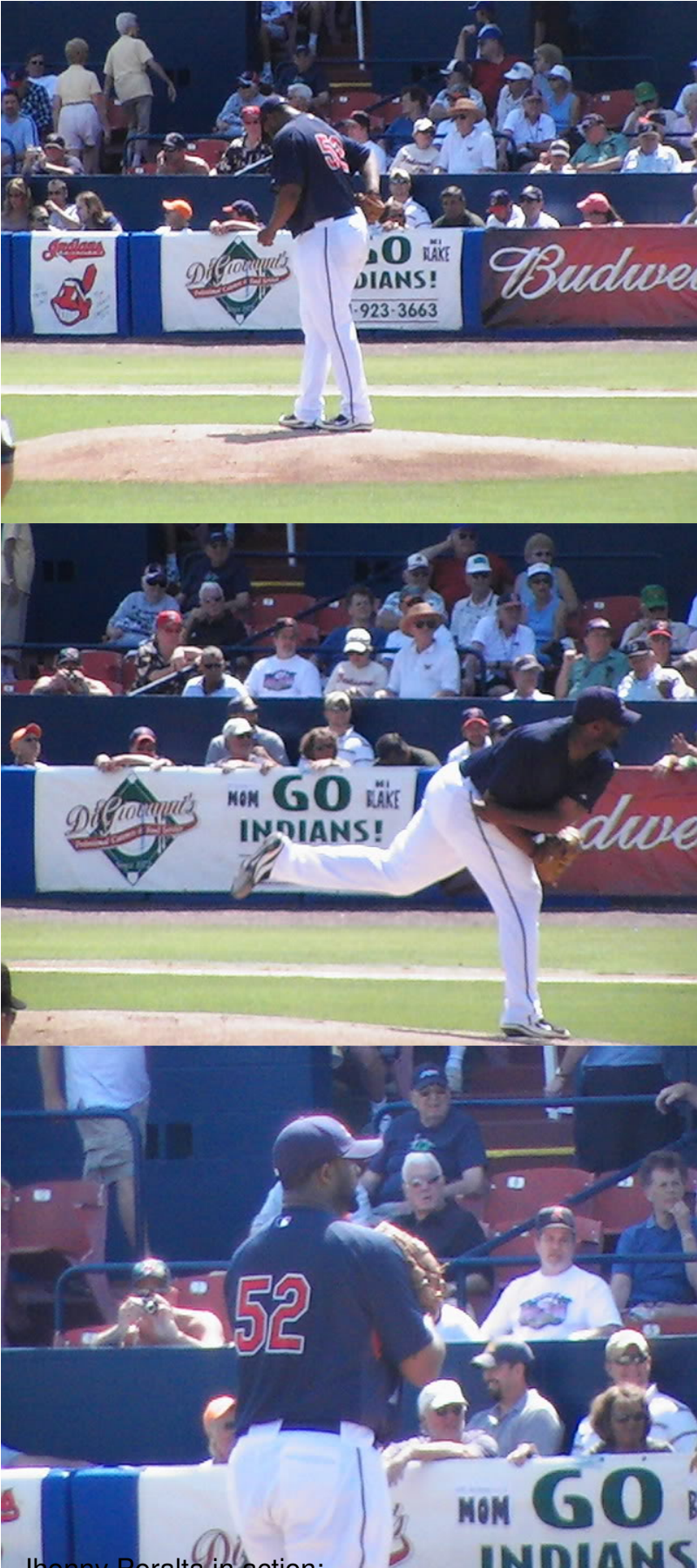
Jhonny Peralta in action: