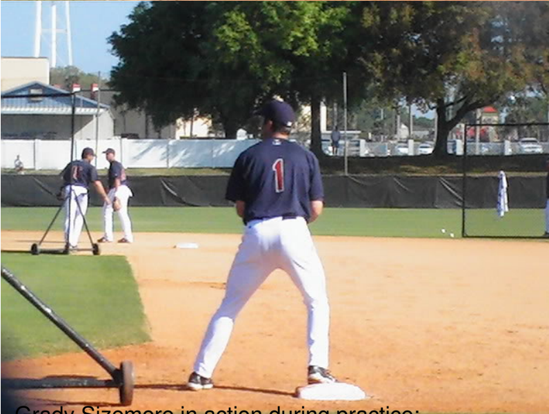
Grady Sizemore in action during practice: