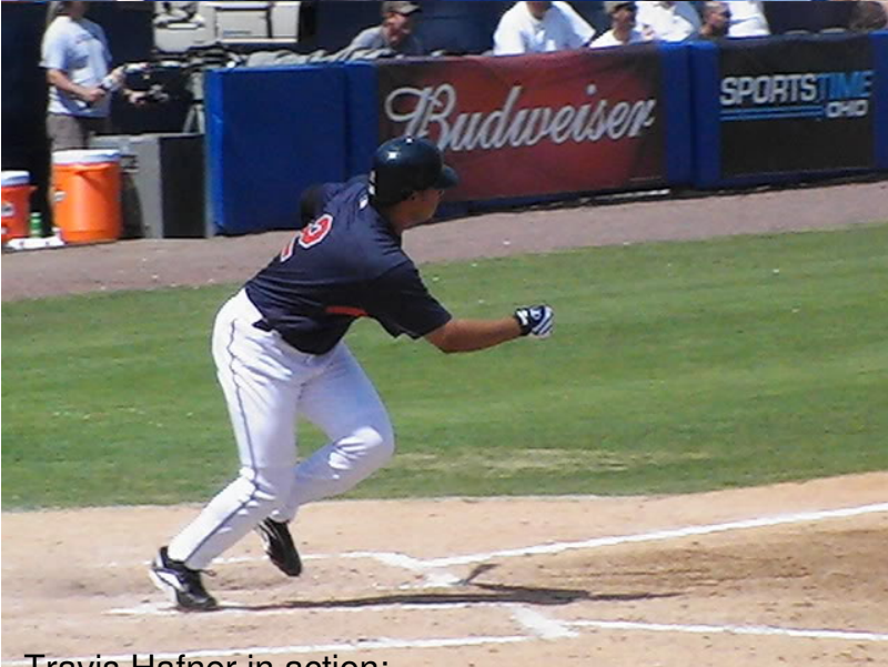
Travis Hafner in action: