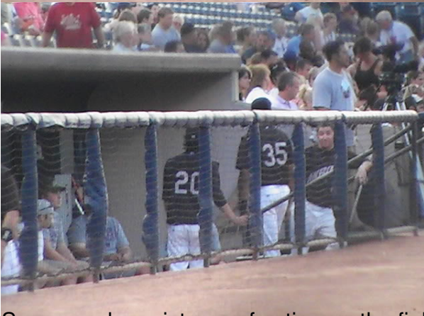
Some random pictures of action on the field: