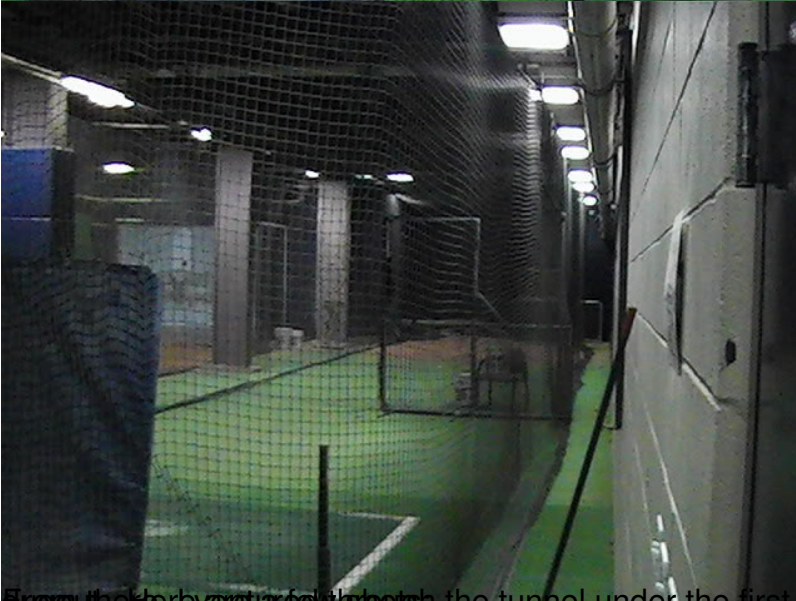
From the back center field photo, the tunnel under the first base side stands and into the Aeros