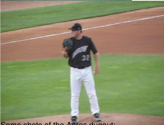
Some shots of the Akron dugout: