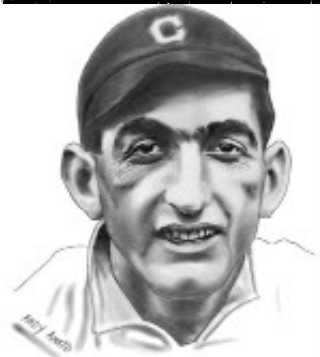
SHOELESS JOE JACKSON