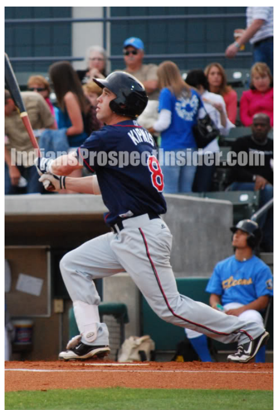
"Minor Happenings" is a weekly column which covers the important developments and news in the Indians farm system. While most of the information in this report is from my own research and through interviews I have conducted with organizational personnel, some information in this report is collected and summarized from the various news outlets that cover each team.

Lots and lots of stuff to share this week, so we will dive right into it.