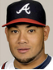
Grady Sizemore (28) vs. Melky Cabrera (26)