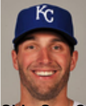
Shin-Soo Choo (30) vs. Jeff Francoeur (27), 2010 Designated Hitter