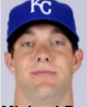
Michael Brantley (29) vs. Alex Gordon (27) Center Field // Trade, 2005 // Free Agent, 2005 Draft