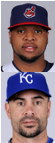
Carlos Santana (age: 25) vs Jason Kendall (36)