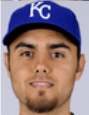
Chris Perez (25) vs. Joakim Soria (26)