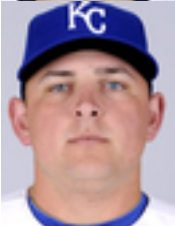
Travis Hafner (34) vs. Billy Butler (24)