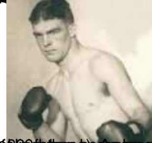
News article snippet mentioning Schmeling and Stribling.