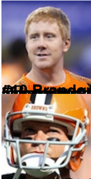
#10 Brandon Phillips #10 Brandon Phillips #10 Brandon Phillips #10 Brandon Phillips #10 Brandon Phillips #10 Brandon Phillips #10 Brandon Phillips #10 Brandon Phillips #10 Brandon Phillips #10 Brandon Phillips