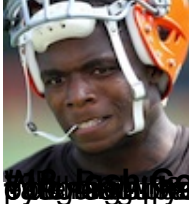
#17 Clayton Kershaw #17 Clayton Kershaw #17 Clayton Kershaw #17 Clayton Kershaw #17 Clayton Kershaw #17 Clayton Kershaw #17 Clayton Kershaw #17 Clayton Kershaw #17 Clayton Kershaw #17 Clayton Kershaw