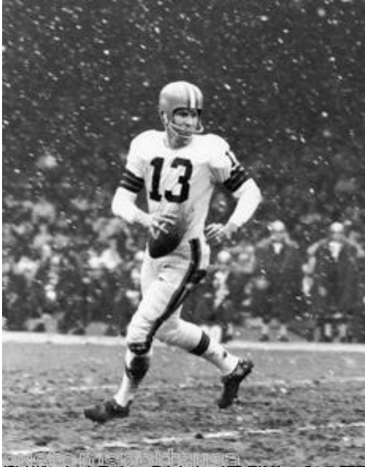
and during the game, he was being singled out