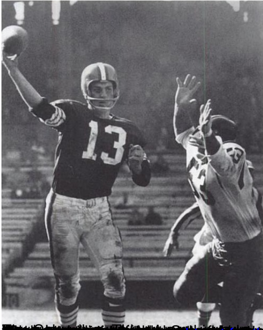
caught out for the purpose of being singled out