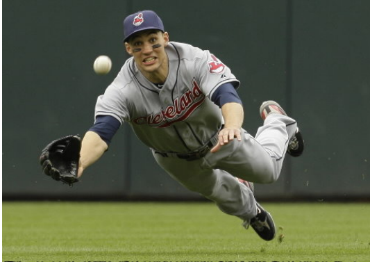
Early Wynn, Frank Sinatra, and Cleveland