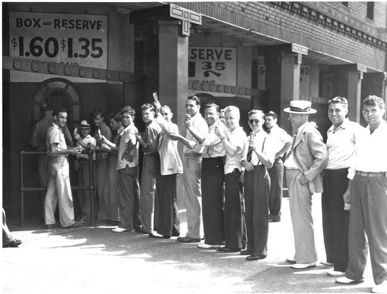
"Sholess" Joe Jackson:

Wednesday, March 20 2013 10:00 AM - Last Updated Wednesday, March 20 2013 3:19 PM