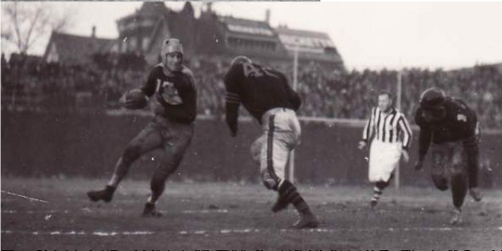
Baseball Club, Cleveland, Ohio, 1908.