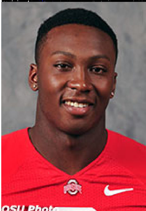
(Perry) (Doran